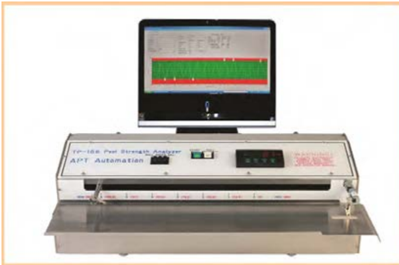
TP-156 with Display

The TP-155/6 Peel Force Analyzers are high precision laboratory quality instruments designed to withstand the demands of common production environments. Constructed of rugged heavy gage steel and aluminum these analyzers are the most reliable tools in the industry for measuring the peel force between carrier and cover tapes.